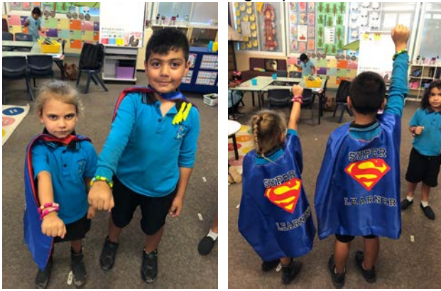
Students in K Ocean are being Super Learners!